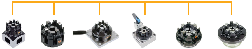
3R-460.31-5 3R-460.34 3R-460.37 3R-460.46 3R-SP18286 3R-SP19047