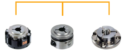
3R-400.34 3R-400.24-11 3R-SP19143